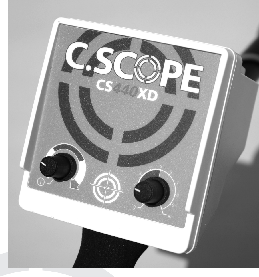
C.Scope CS440XD Metal Detector